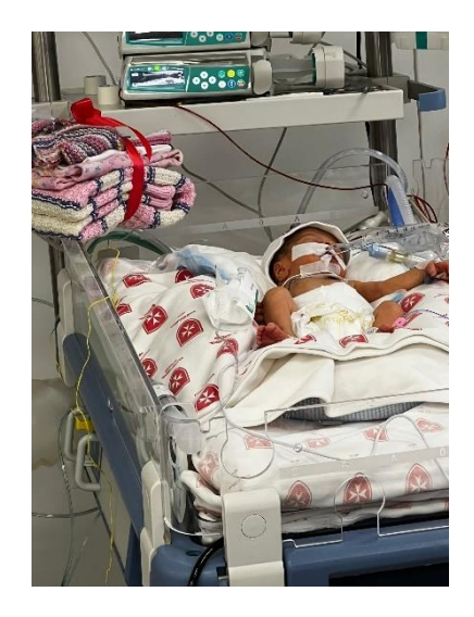
We succeeded in making 25 December unforgettable day

To maintain our yearly tradition, and in the perspective of spreading the joy and love within the patients surrounding us and the team of Holy Family Hospital on the 25th December marking the birth of our Saviour, gifts were distributed to the mothers and babies.