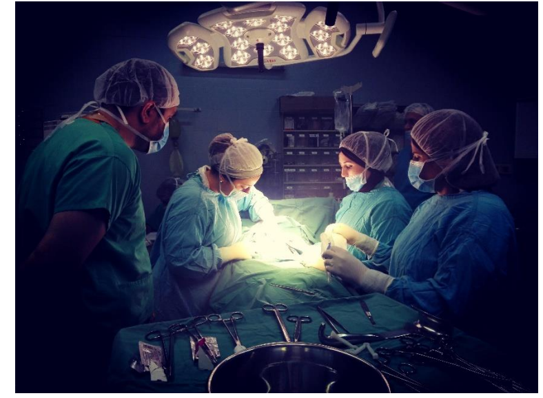
We are glad to have you within our team !!