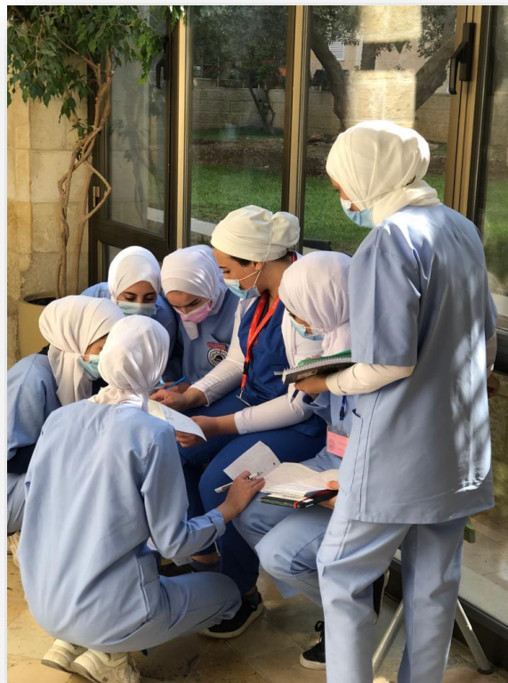
A photo for Our Clinical instructor and her students gathering to discuss a medical case

Health professional training programs generally require clinical, workplace-based education prior to degree attainment. Holy Family Hospital being a certified training hospital has academic partnerships between several local universities such as Bethlehem University, Al-Quds Open University and Hebron University to train the future Nurses and Midwives and help the next generation of healthcare. Our Senior Midwives and Nurses are the clinical Instructors responsible for the training of these students.