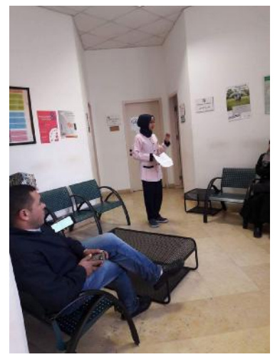
Outpatient presentation done by Bethlehem University Nursing Student